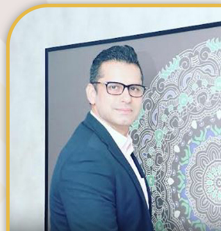
Mr. Sachin Bansal